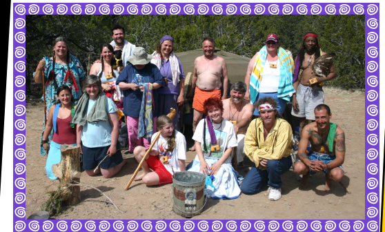
Radiant Questors May 2008