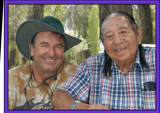
Two Bears and Bear Heart

June 3—7, 2009 Sept 9—13, 2009 Cloudcroft, NM